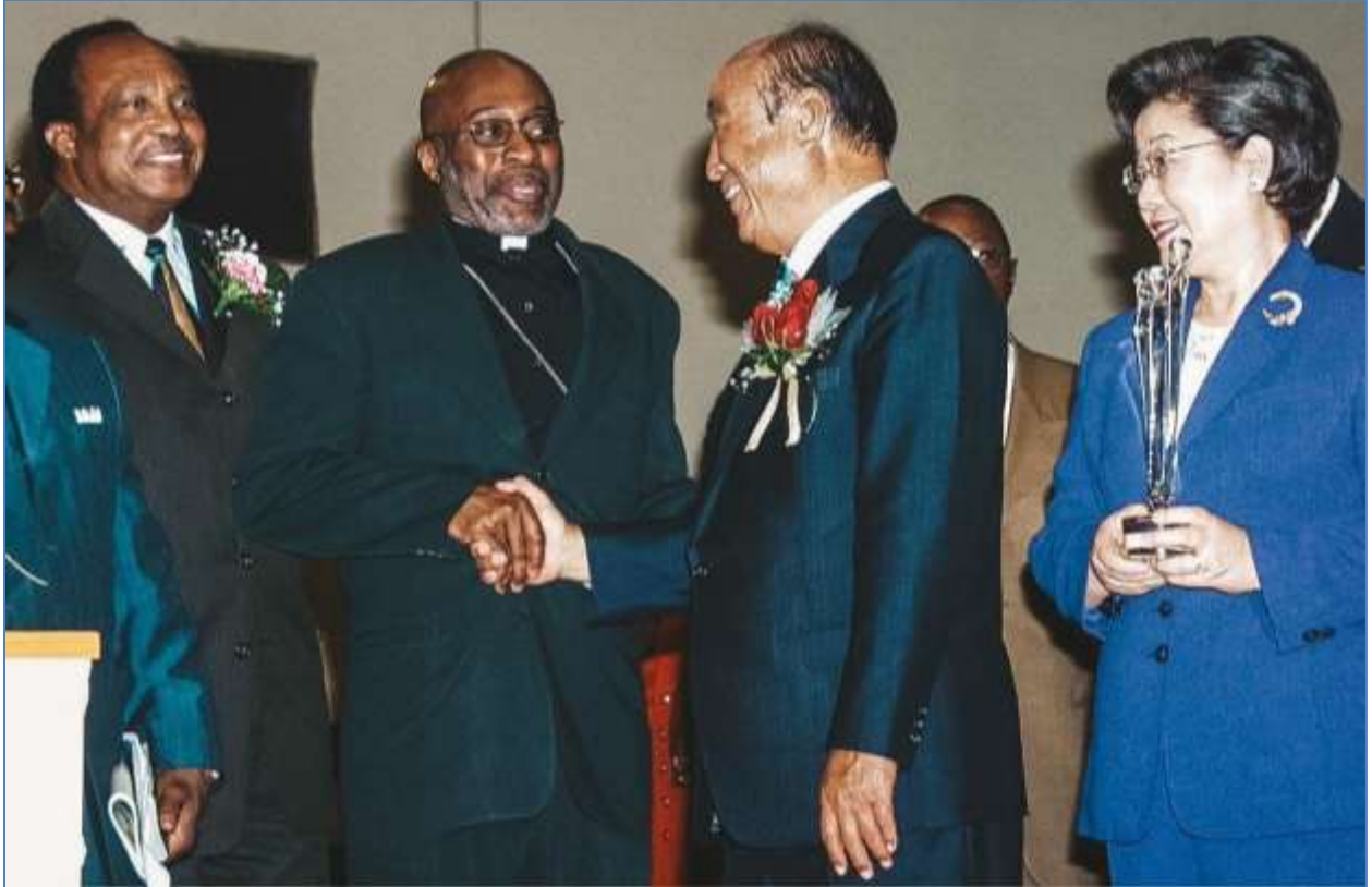
We Will Stand Tour, Texas, 2001