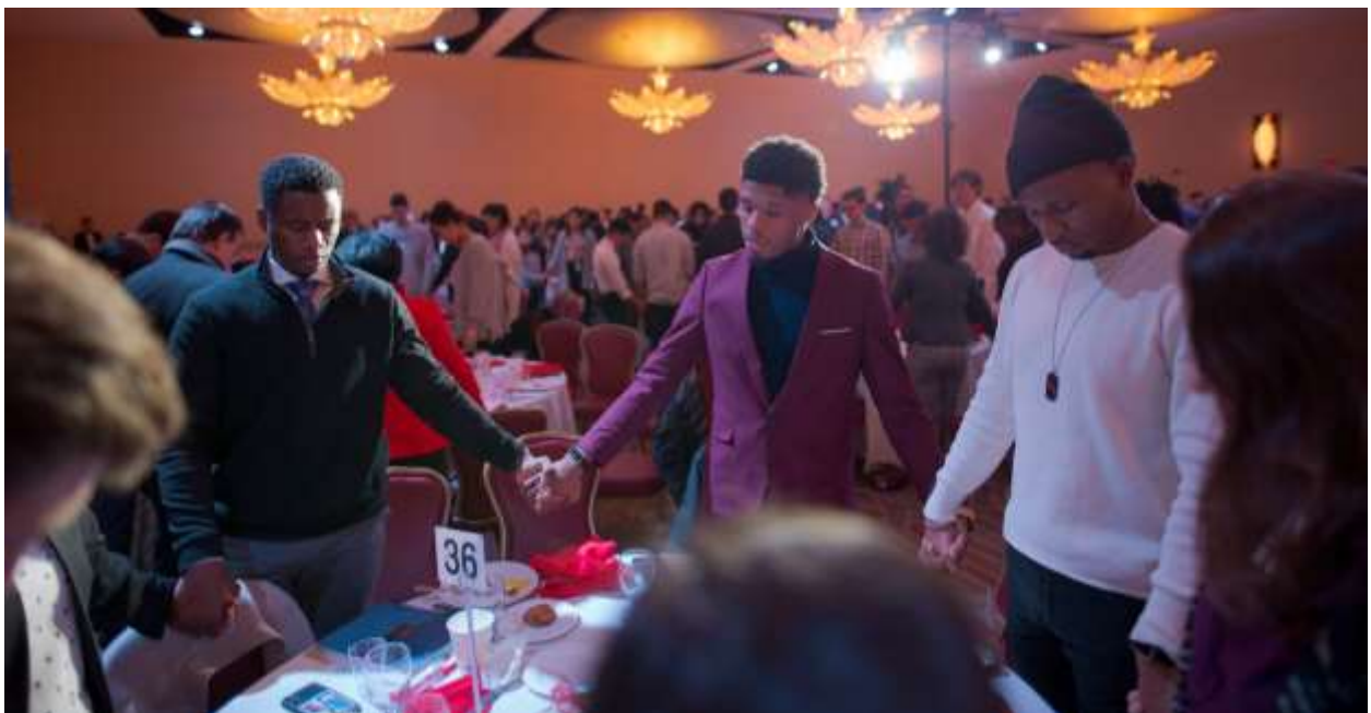
YCLC Banquet, New Jersey, 2019

"For America to be a template of the world ... we need to bring up all the young people through YCLC so they can be fruitful in fellowship," said Rev. Sykes. "We must continue to come together and coalesce in order to share the good news we have been tasked with."