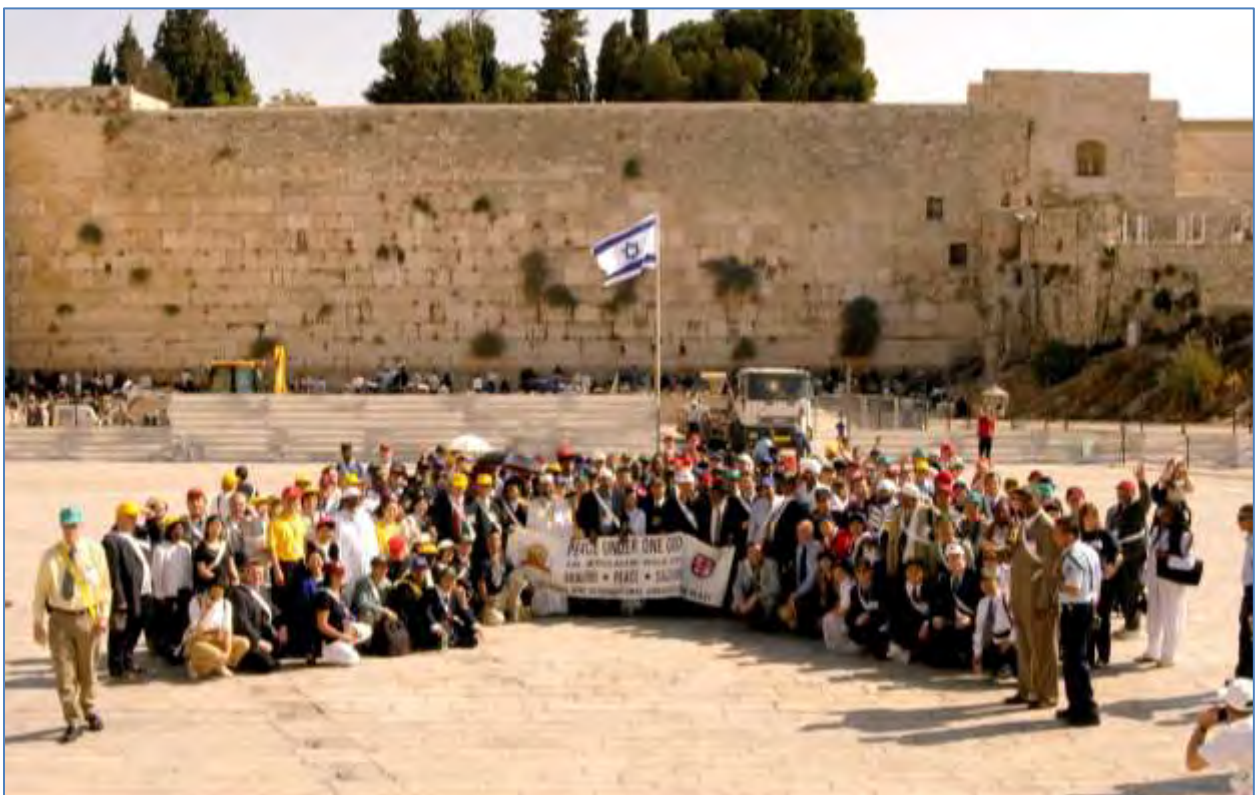
ACLCLC in Israel, 2003

May 21 marked the 22nd anniversary of the American Clergy Leadership Conference ( ACLCLC ), which was founded in 2000 by True Parents in Korea. National leaders and members of ACLCLC - a coalition of clergy united to strengthen marriages, rebuild families, restore communities, and renew America and the world - celebrated in the Northeast with a special anniversary program held online through Zoom and social media. Some 60 participants heard messages from ACLCLC's founding figures and other faith leaders.