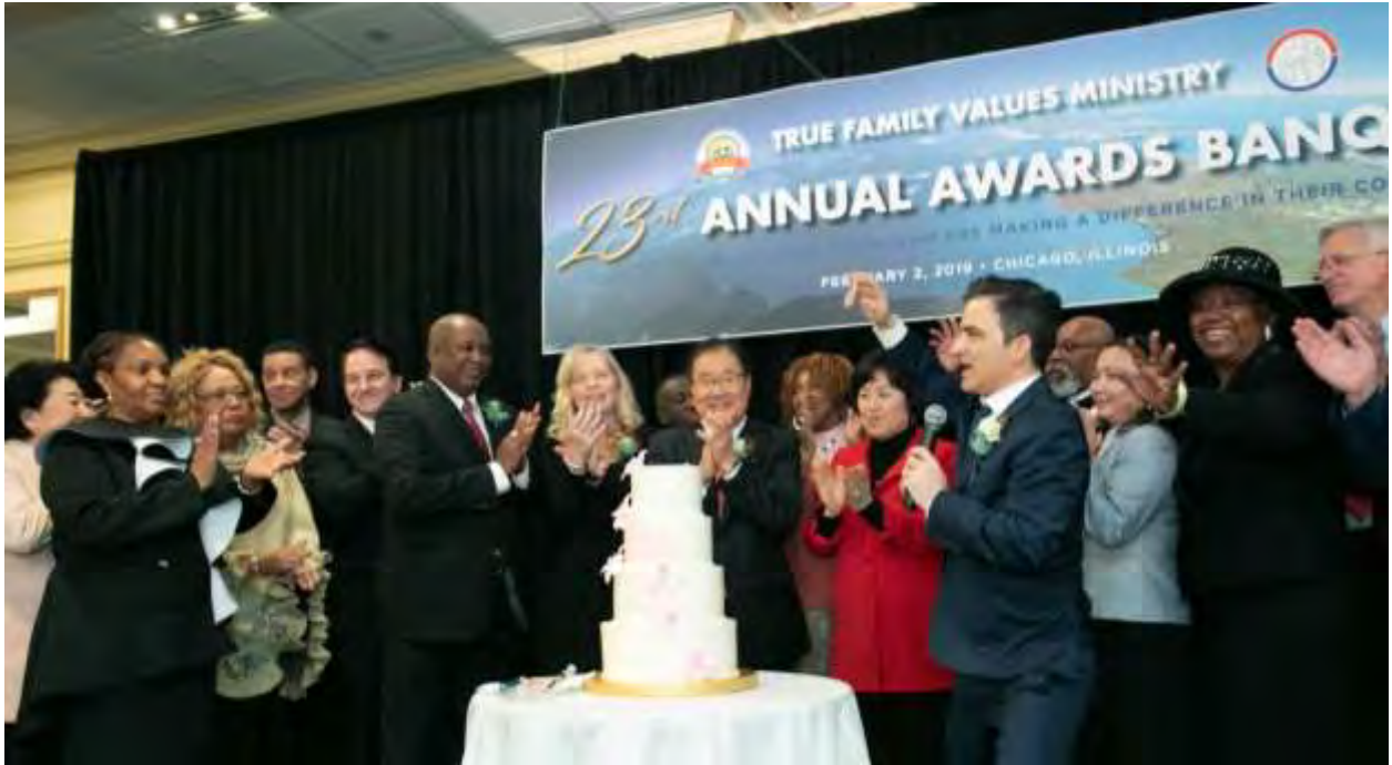
True Family Values Banquet, Chicago, 2019

The ACLC also played a central role in True Father's 2001 national speaking tour, "We Will Stand in Oneness." And since its inception, multiple associations have emerged, including The 172 Clergy and Women in Ministry (WIM). In December 2019, True Mother inaugurated the World Clergy Leadership Conference ( WCLC ), where two more associations were established: the Korean Clergy Leadership Conference (KCLC) and the Young Clergy Leadership Conference ( YCLC ).