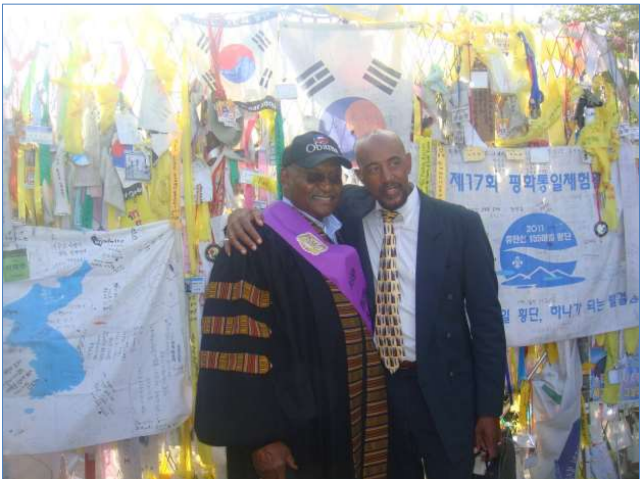
ACLC at the DMZ, South Korea, 2011

"We've also been to Korea, right at the DMZ line, where 120 pastors prayed for peace," he continued. "We laid our hands on the fence that divides the North and South from families, friends, and loved ones. Father Moon prayed, as Jesus prayed, that we can all come together and be as one ... What an experience."